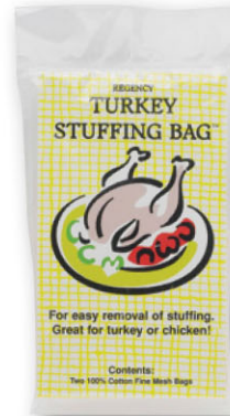
RW875 • Turkey Stuffing Bag 4" x 6 1/2" (cd/2)