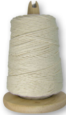
RW1675 • Cooking Twine w/ Wooden Holder and Metal Cutter 550 ft. (bx)