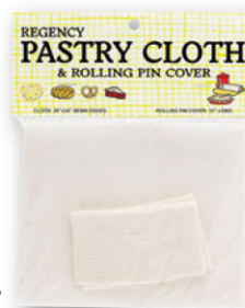
4444 • Pastry Cloth & Rolling Pin Cover (cd)