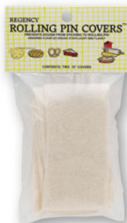
40404 • Rolling Pin Covers, 14" (cd/2)