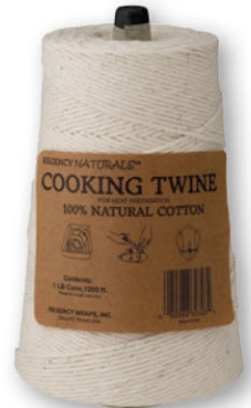
6100 • Cooking Twine 1,140 ft.