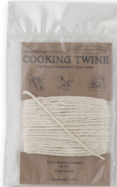
RW1650N • Naturals Cooking Twine 25 ft. (cd)