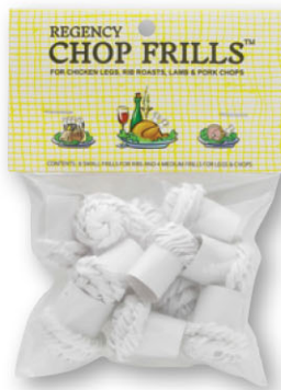
70707 • Chop Frills (pk/12)