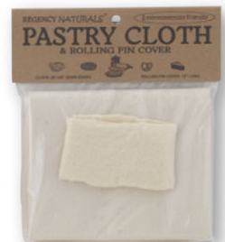
RW1050N • Naturals Pastry Cloth 100% Cotton, 24" x 20" (cd)