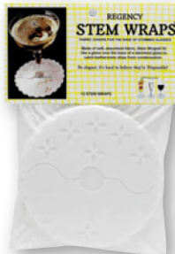
26 • Stem Wraps 4" (cd/12)