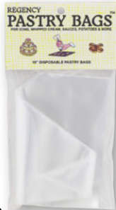
RW1075 • Pastry Bags Disposable, 10" (cd/6)