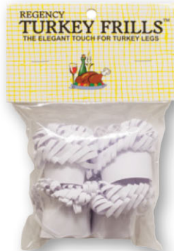
90909 • Turkey Frills (cd/4)