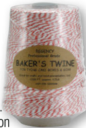
RW1627 • Baker's Twine 2,000 ft., 1 1/2-lb. cone, 100% cotton