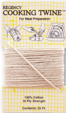
60606 • Cooking Twine 25 ft. (cd)