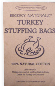
RW875N • Naturals Turkey Stuffing Bag 100% Cotton (set/2)