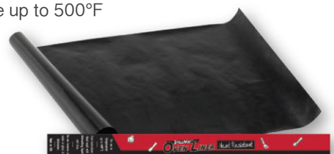
8000 • Spillmat Oven Liner Non-Stick Fiberglass, 23" x 16" (bx)